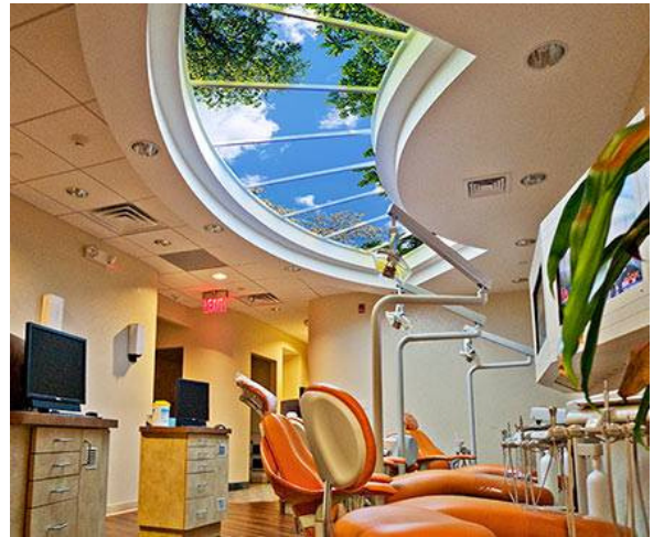
Sky Factory Luminous SkyCeiling™ New York Pediatric Dentistry