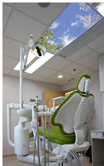
Union Hospital Dental Centre Hong Kong