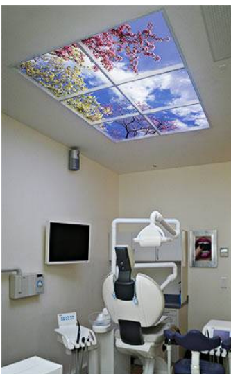
Dental Surgery France

The Sky Factory will exhibit at the American Academy of Cosmetic Dentistry conference May 3 – 5 at the Gaylord National Hotel and Convention Center in National Harbor, MD. Visit booth #929 to experience eEscape and SkyV , new digital cinema products that feature UltraHD motion and sound displayed on commercial-grade LED monitors. Sky Factory's fusion of fine art and cutting-edge technology transforms dental offices into welcoming and relaxing environments by bringing the soothing properties of nature indoors.